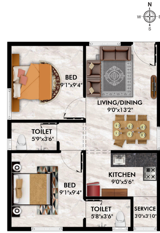
Flat 10 552 Sq ft Saleable area