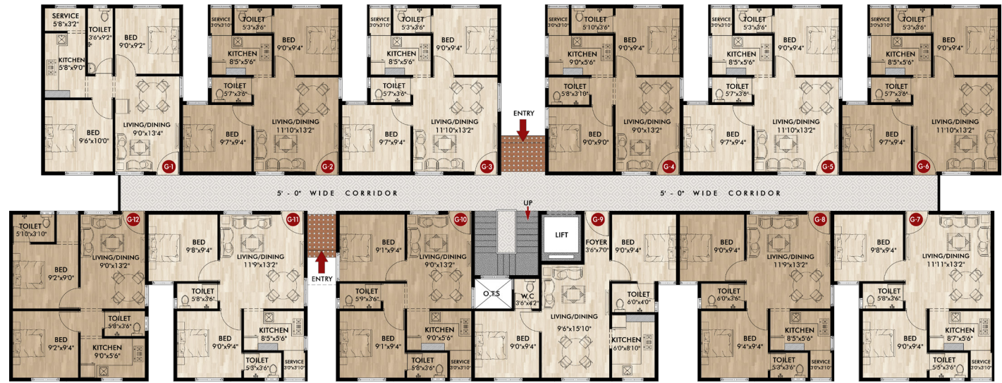
Block B Ground floor plan