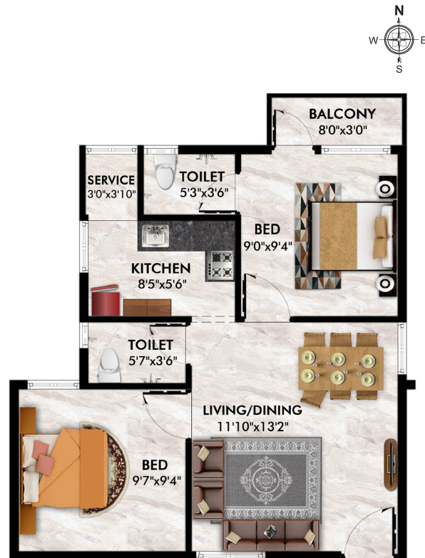
Flat 2 608 Sq ft Saleable area