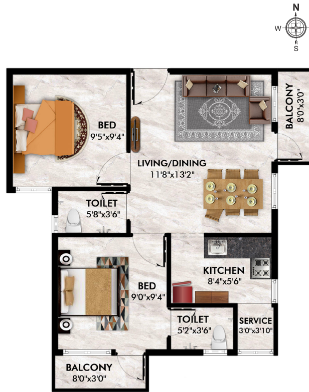
Flat 7 635 Sq ft Saleable area